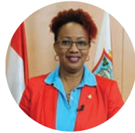
Hon. Silveria E. Jacobs Prime Minister, St. Maarten