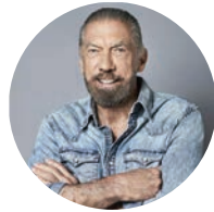
John Paul DeJoria Entrepreneur and Philanthropist, Co-Founder, Paul Mitchell Systems and Co-Founder, Patron Spirits International