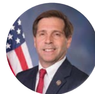
Chuck Fleischmann U.S. Representative (TN-03), Chairman of the Energy and Water Subcommittee of Appropriations